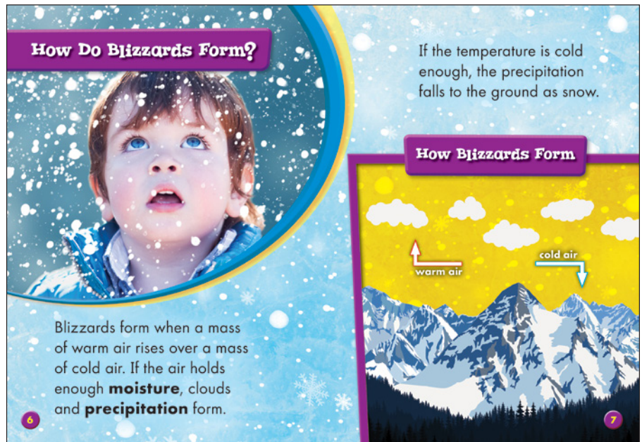
Sample spread from Blizzards